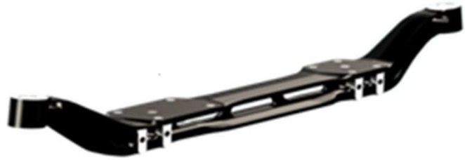
Front Axle Beams incl. machining