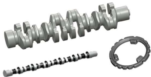
Engine and Transmission Components