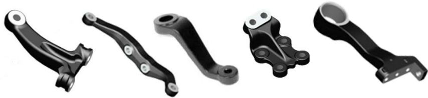
Levers incl. machining + broaching/calibration