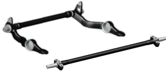
Cabin Stabilizer incl. welding and machining